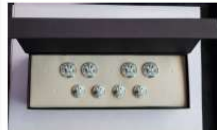
SILVER BLAZER BUTTON