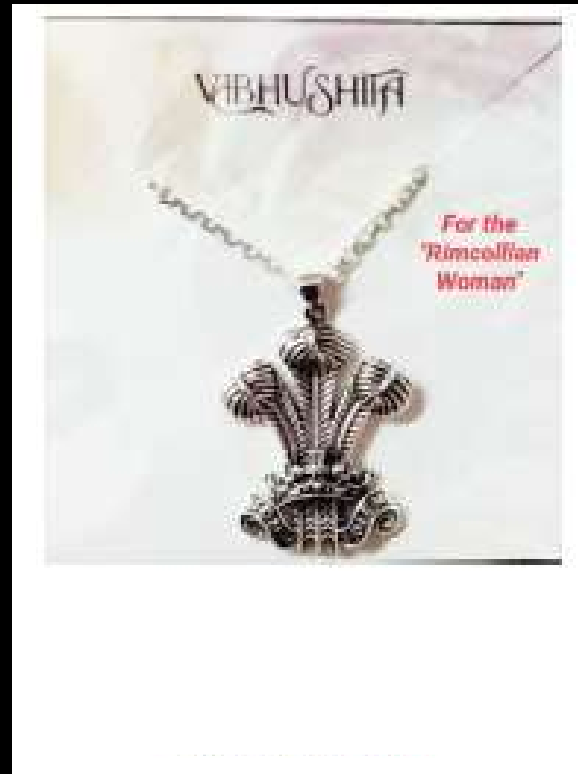
SILVER PLATED PENDANT WITH SILVER CHAIN (Approx wt. 9.46 gm)